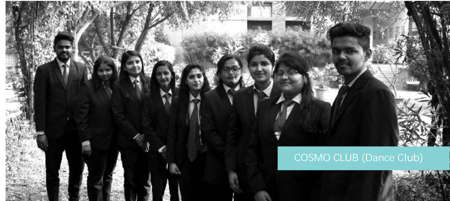
COSMO CLUB (Dance Club)