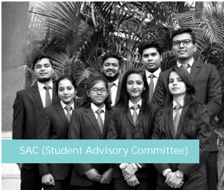
SAC (Student Advisory Committee)