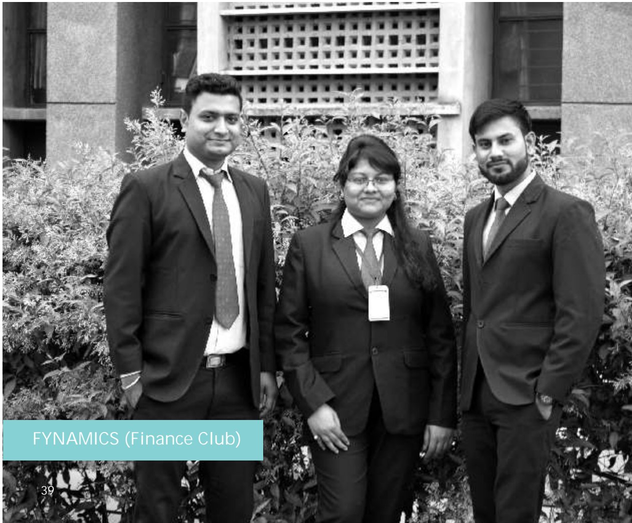
FYNAMICS (Finance Club)