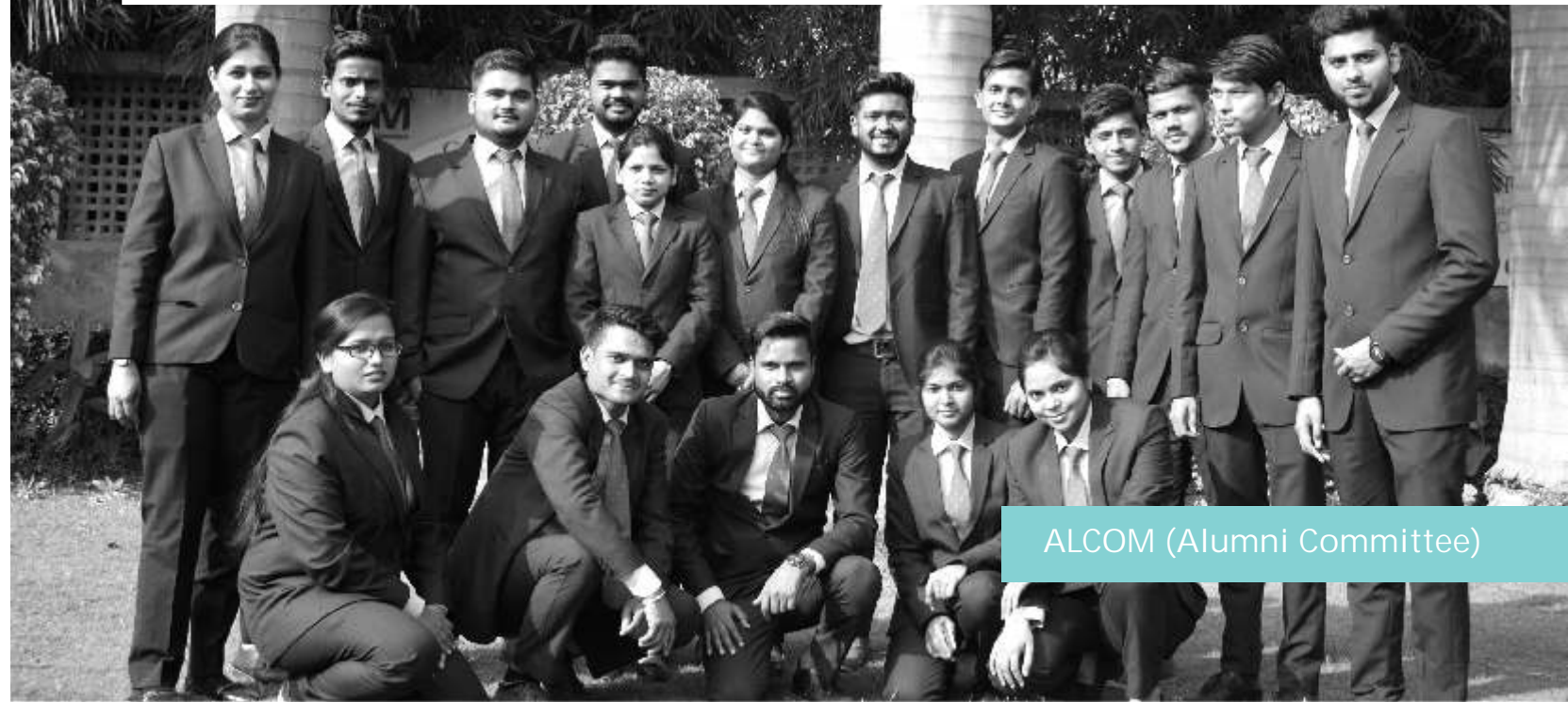
ALCOM (Alumni Committee)