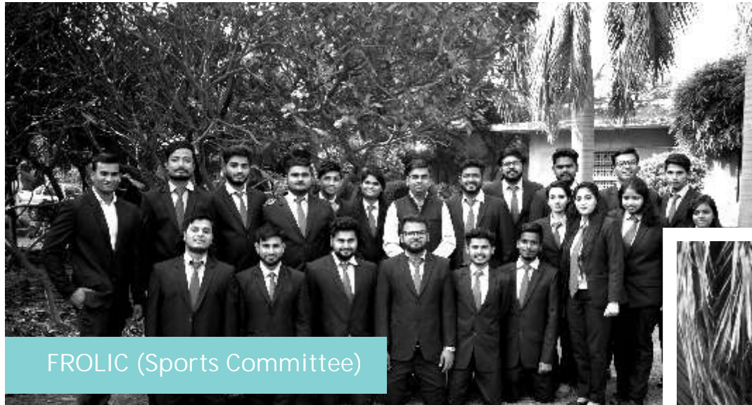
FROLIC (Sports Committee)