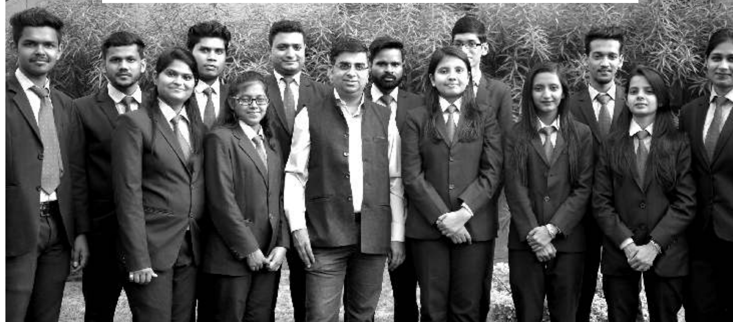
BULLETIN- THE NEWSLETTER COMMITTEE