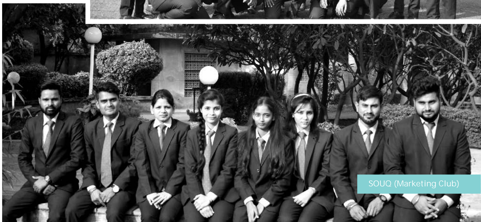
SOUQ (Marketing Club)