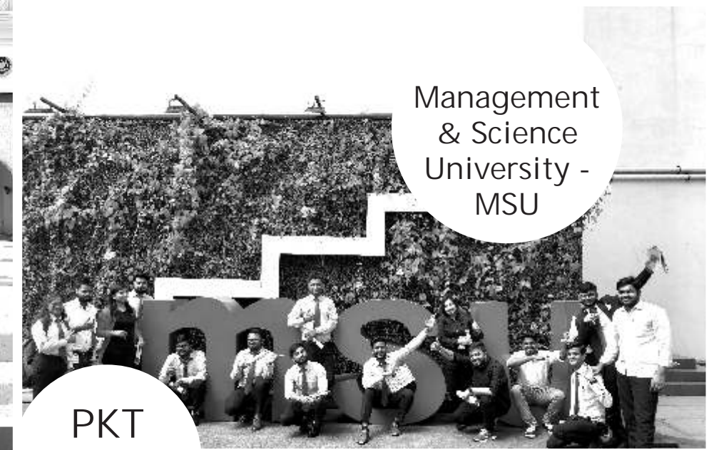
Management & Science University - MSU