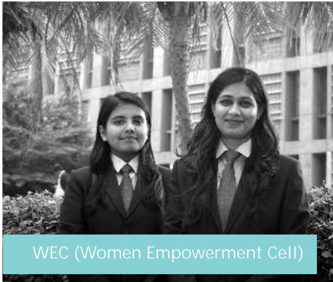
WEC (Women Empowerment Cell)