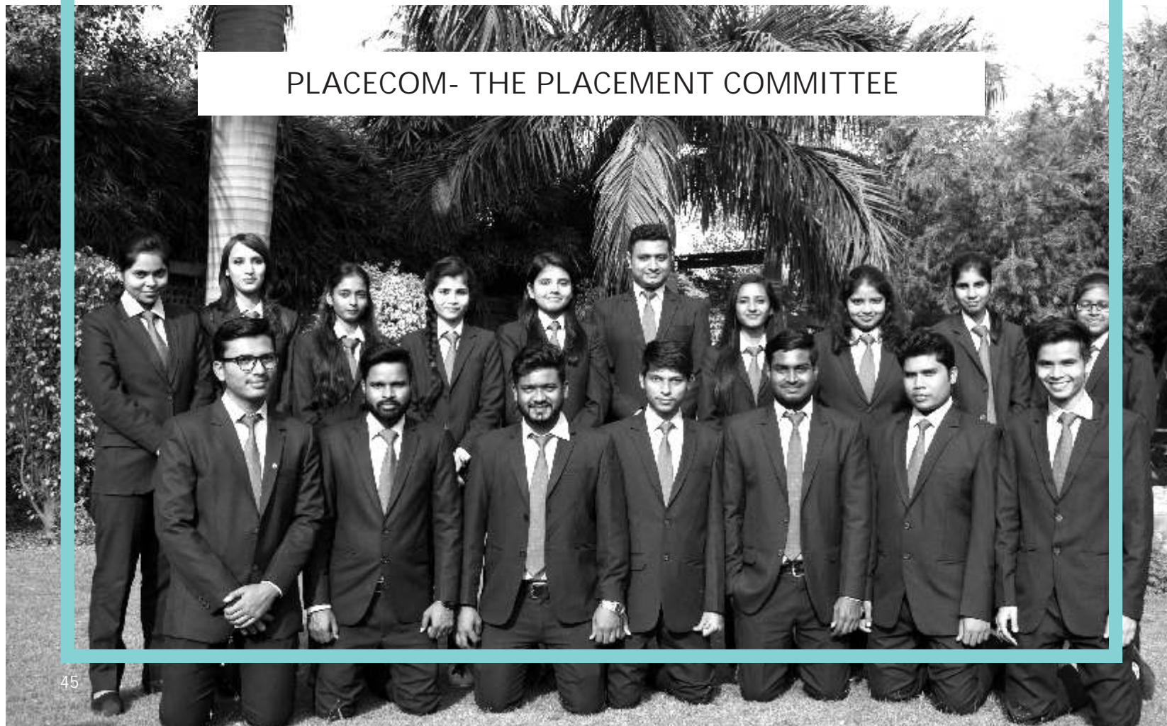
PLACECOM- THE PLACEMENT COMMITTEE

Individual commitment to a group effort is what makes a team work, a company work, a society work and a civilization work. Alone we can do so little, together we can do so much. And with this belief, the members of Place-Com work with utmost dedication and sincerity for the betterment of the future minds.