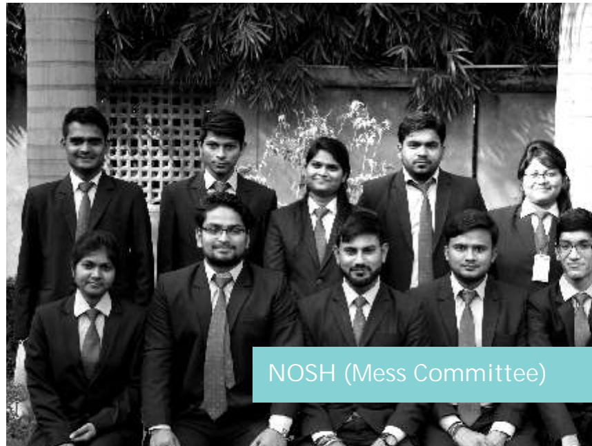
NOSH (Mess Committee)