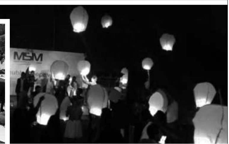
CULTCOM- THE CULTURAL COMMITTEE